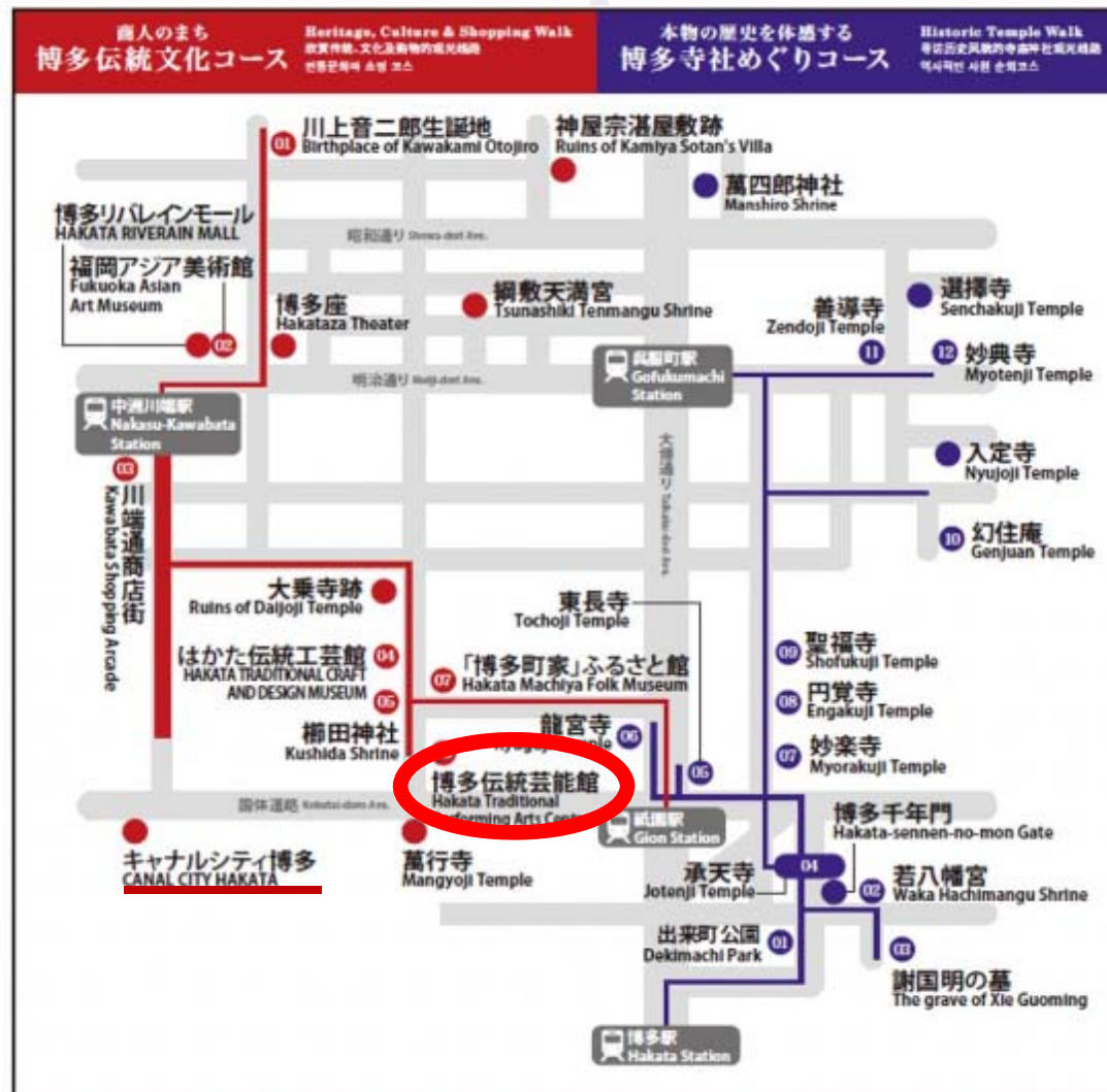
▲Fukuoka Official City Guide “Yokanabi” Available from “New Package Tour in Hakata Old Town” ( https://yokanavi.com/news/119857/ )

In addition, enjoy the variety of tourist attractions, shops, and dining establishments found near the Hakata Traditional Performing Arts Center with our package tour.