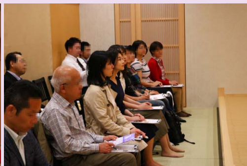
Be a part of the action from seats close to the stage! Come enjoy a dance performance as well as a traditional zashiki asobi game experience! ♣