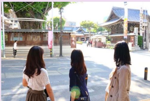
The "Hakata Traditional Performing Arts Center", just moments from Kushida Shrine's (Hakata's main shrine) holy street.