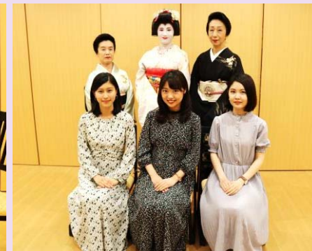
Be a part of the action from seats close to the stage! Come enjoy a dance performance as well as a traditional zashiki asobi game experience! ♡