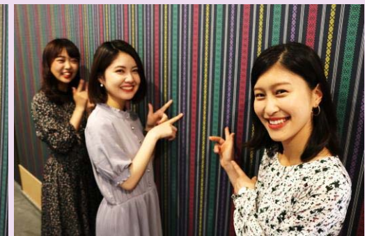
You will be welcomed by a hallway adorned with "Hakata Kenjo", the design most representative of the local Hakata-ori cloth.