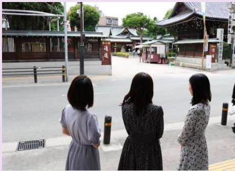
The "Hakata Traditional Performing Arts Center", just moments from Kushida Shrine's (Hakata's main shrine) holy street.