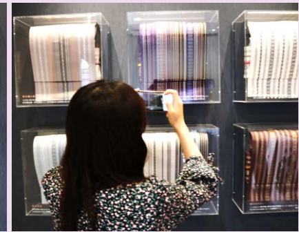
At the entrance to the facilities you will find many Hakata Obi on display!

Take in the magic of the building itself, brimming with Hakata tradition!